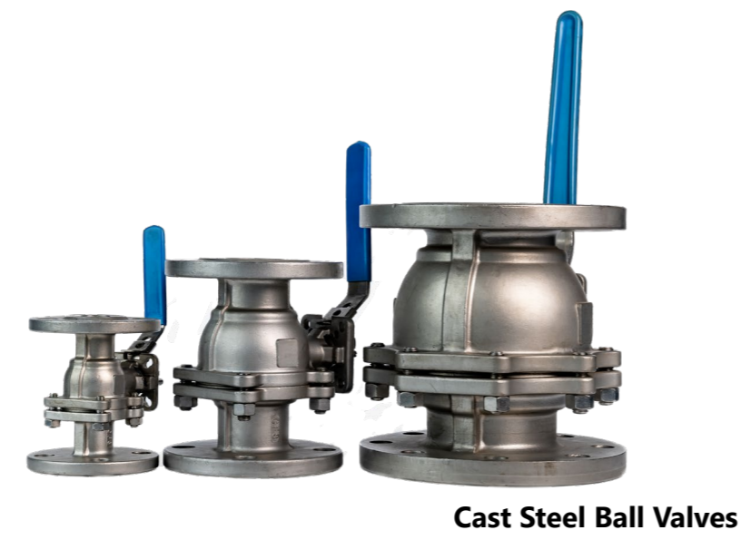
Cast Steel Ball Valves